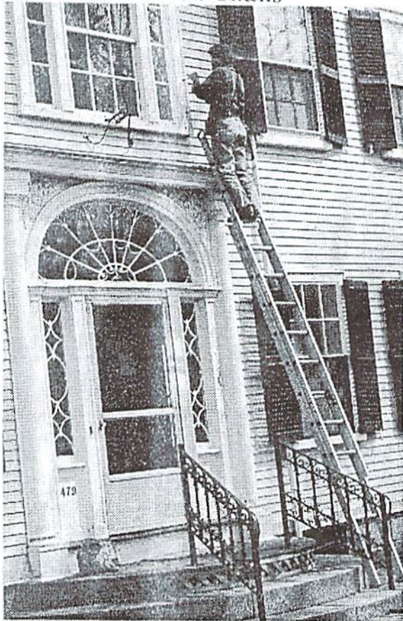
The Palladian windows are being lagbolted into place.

As you surely have noticed, the Nathaniel Winsor House in Snug Harbor is a beehive of activity. Recently purchased by the Duxbury Rural & Historical Society, this handsome landmark is undergoing a major restoration in preparation for a Designers Showhouse the end of May.